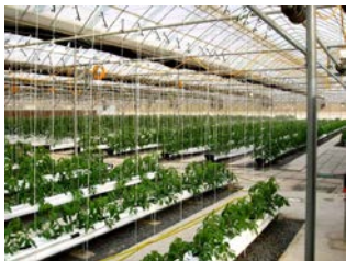
Nursery or Greenhouse (planting, potting, pruning, watering, harvesting)