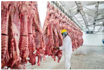
Processing & Packing (fruit, vegetables, chicken, eggs, pork, beef, lamb or other livestock)

CIRCLE all that apply below, even if the work was only for a short period of time.