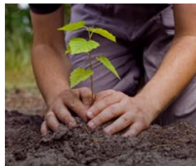
Forestry (soil preparation, planting, growing, cutting trees)