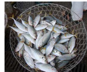
Fishing & Fish Processing (catching, sorting, packing, transporting fish)

If you answered "yes" to either question above, please continue below. Otherwise, your form is complete.